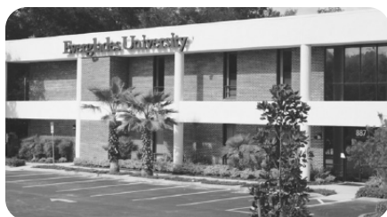
Orlando Branch Campus