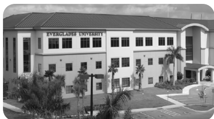
Sarasota Branch Campus