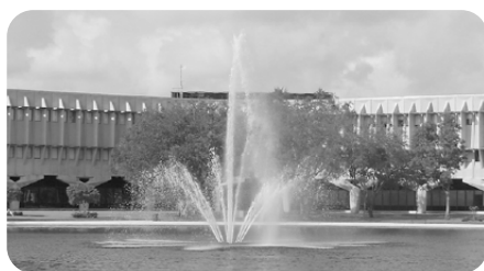
Boca Raton Main Campus