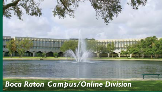
Boca Raton Campus/Online Division

Apply online at EvergladesUniversity.edu