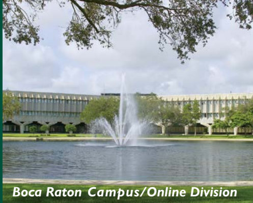
Boca Raton Campus/Online Division